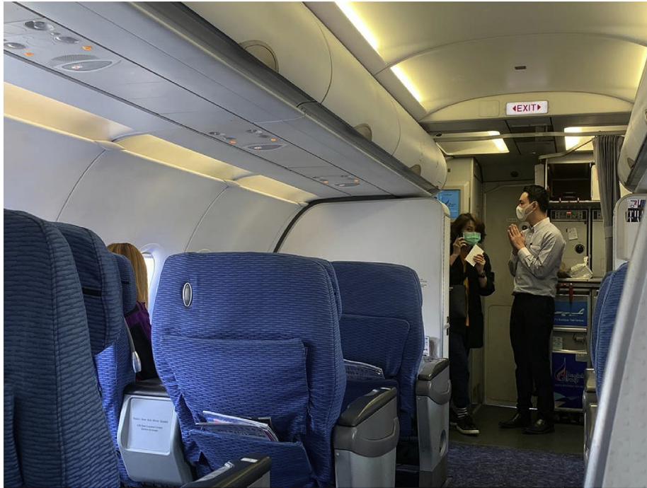
Fig. 1. Mandatory mask use by flight attendants, Bangkok Airways, February 22, 2020.

distancing, reversal of societal functions such as home-schooling, teleworking, and cancellation of public events including religious services. Pandemic mitigation is unachievable if MGs are permitted.