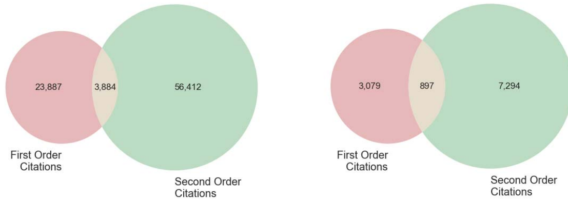
Figure 3. Number of unique accounts (Twitter) and public spaces (Facebook) linking to research articles (first-order citations) and news stories that mention those articles (second-order citations).

a) Number and overlap of unique Twitter accounts (user IDs) mentioning research articles (first-order citations) and news stories mentioning those articles (second-order citations)