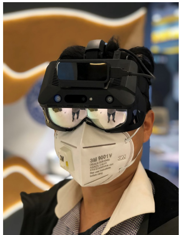
Fig. 5. BRM all-in-one machine.

Simultaneously, as the nCapp intelligent assisted COVID-19 diagnosis system collects a large amount of clinical diagnostic data from patients with COVID-19, through data feature engineering and statistical methods, the data can be further clustered and analyzed to achieve a more intelligent distinction between suspected and suspicious cases in patients with a negative nucleic acid test result.