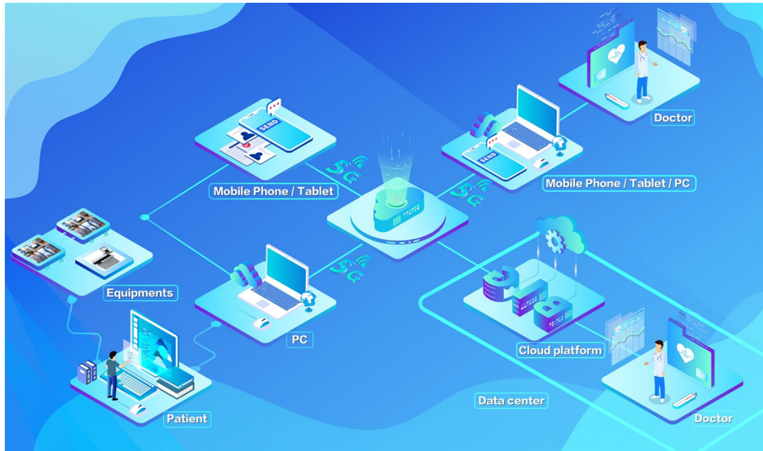
Fig. 1. Three-level linkage of the nCapp diagnosis and treatment system for COVID-19 based on the Internet of Things “cloud plus terminal”.

new services for different service levels and performance requirements.