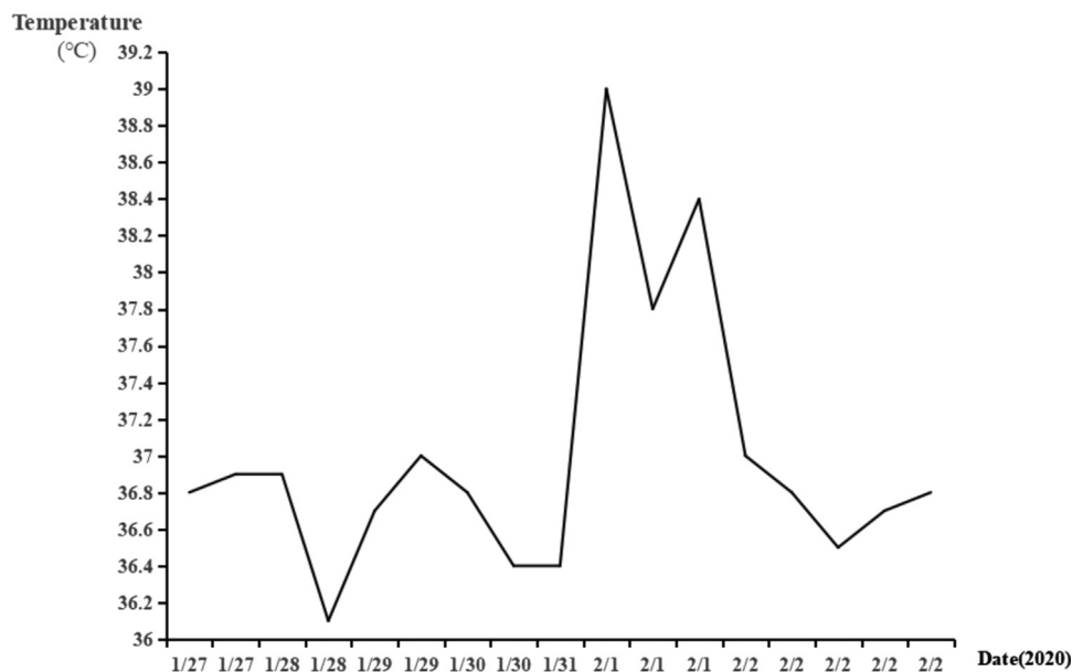
Fig. 1. Body temperature during hospital admission.

On the second day of admission, the patient excreted bloody stools several times during the day. He received initial symptomatic treatment with oral pantoprazole enteric-coated capsule, once a day. Abdominal computerized tomography (CT) scan performed on the third day of admission suggested the presence of a space-occupying lesion at the right adrenal gland; the diagnosis of adrenal tumor was considered. As the patient was elderly and not specifically symptomatic, follow-up observation was recommended. A magnetic resonance imaging (MRI) examination revealed abnormal signals within the seminal vesicle, suggesting the possibility of internal hemorrhage; follow-up prostate MRI was recommended.