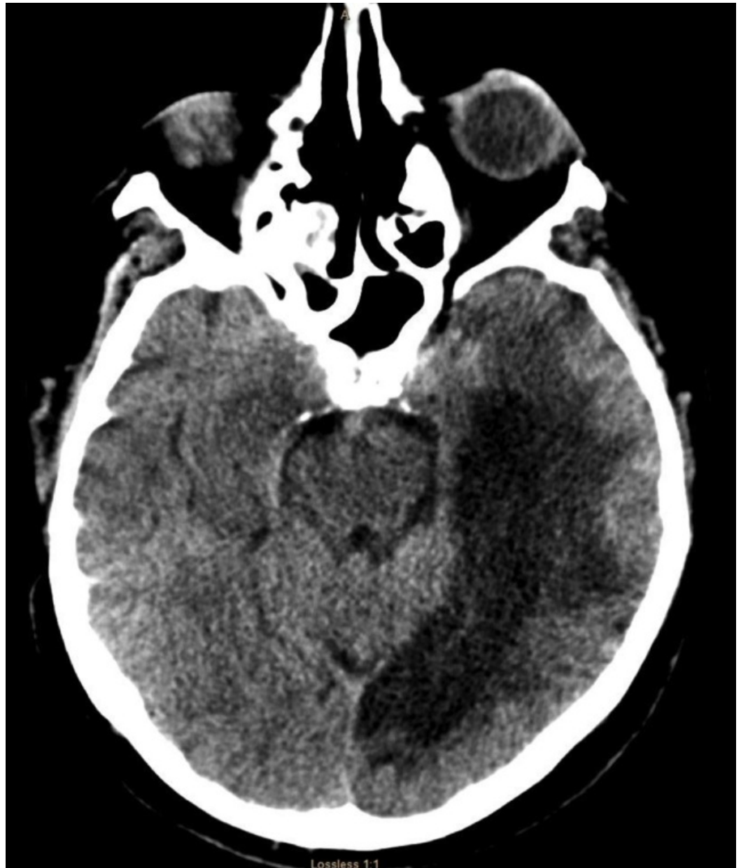
FIGURE 2: CT scan of the head that shows no acute changes. There is an area of hypodensity in the right temporal region, consistent with patient know prior history of left PCA embolic stroke