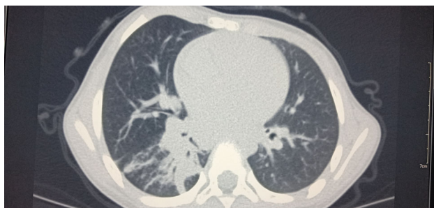
Fig. 2 Computerised tomographic scan of 6-year-old girl.