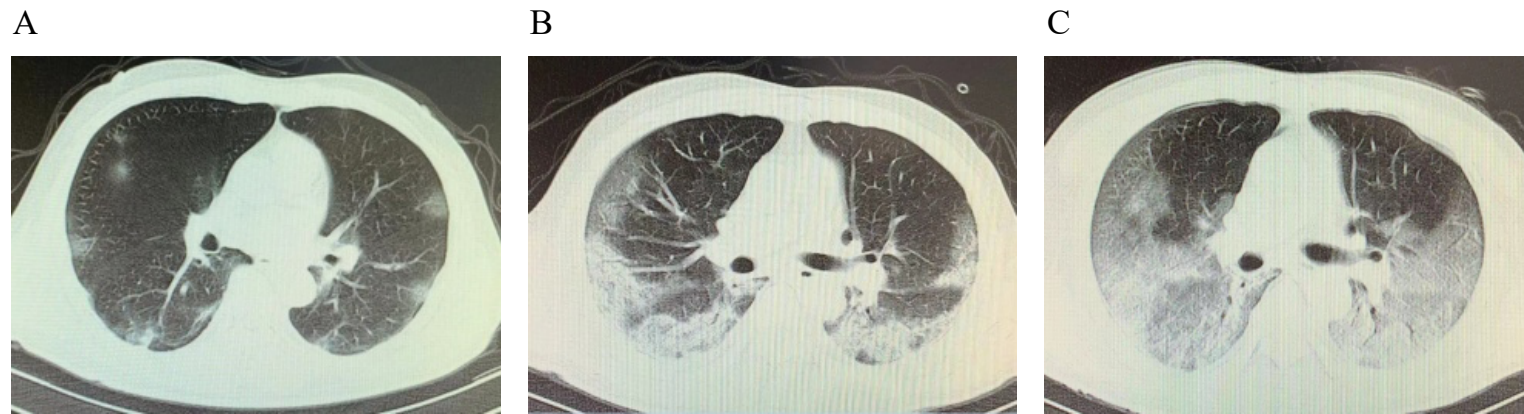
Figure 2. Representative chest CT images of the index patient (C-1) showing rapid progression of bilateral infiltrating shadows in the lungs.