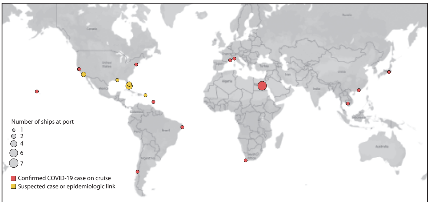
FIGURE 2. Cruise ships with coronavirus disease 2019 (COVID-19) cases requiring public health responses — worldwide, January–March 2020

During the initial stages of the COVID-19 pandemic, the Diamond Princess was the setting of the largest outbreak outside mainland China. Many other cruise ships have since been implicated in SARS-CoV-2 transmission. Factors that facilitate spread on cruise ships might include mingling of travelers from multiple geographic regions and the closed nature of a cruise ship environment. This is particularly concerning for older passengers, who are at increased risk for serious complications of COVID-19 (4). The Grand Princess was an example of perpetuation of transmission from crew members across multiple consecutive voyages and the potential introduction of the virus to passengers and crew on other ships. Public health responses to cruise ship outbreaks require extensive resources. Temporary suspension of cruise ship travel during the current phase of