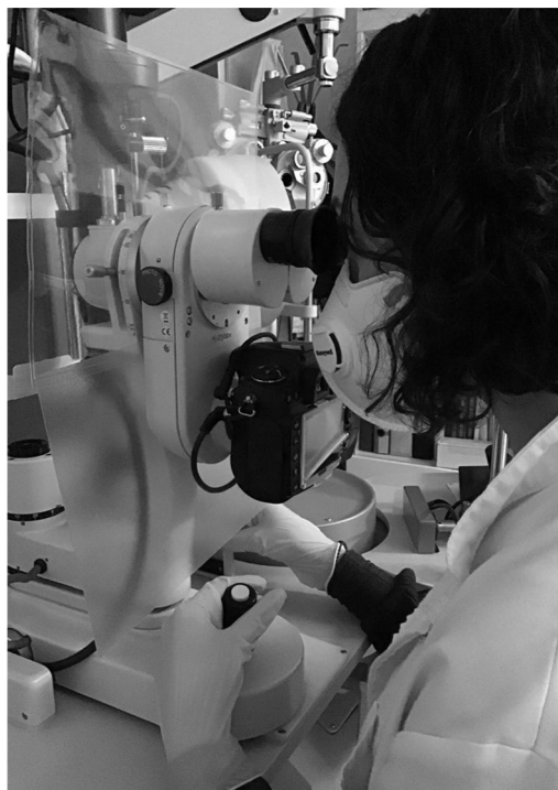
Fig. 2. A large clear plastic sheet, working as a protective shield, has been cut and placed between the ocular and slit lamp [9,10].

This outbreak is evolving rapidly, the impact to the public health risks to be massive with huge economic and social disruption. In the