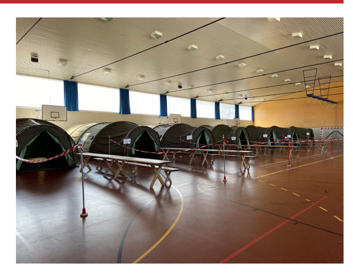
Figure 1 Tents inside a military gym to provide extra quarantine/ isolation facilities. The separate tables are for catering.

Finally, we performed serological test on isolated MAF 14 days after patient 1 was diagnosed with covid-19. In patients 1 and 2, serological testing was positive for both IgM and IgG. Interestingly, all other close contacts to our positive patients, including the third suspected asymptomatic carrier, tested negative.