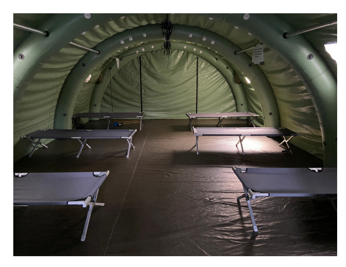
Figure 2 Sleeping beds inside a military tent shown in Figure 1.

Our series shall emphasise the psychological burden during the time of quarantine and isolation.<sup>10</sup> Although in the military setting, we had the relative advantage of having to group MAFs