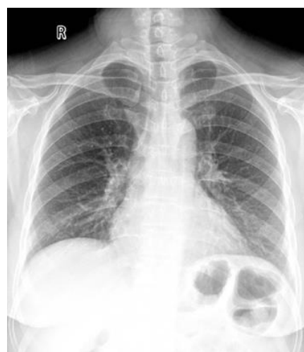
Figure 3. Chest Radiographs image of the patient on Feb 28. After treatment, lesion in the lungs were reduced. Hardly GGO samples were seen.