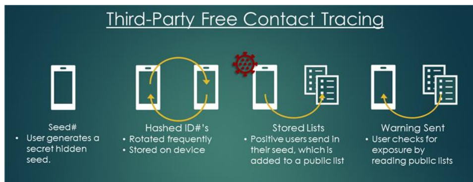
Figure 2: PACT Tracing Protocol. First, a user generates a random seed, which they treat as private information. Then all users broadcast random-looking signals to users in their proximity via Bluetooth and, concurrently, all users also record all the signals they hear being broadcast by other users in their proximity. Each person’s broadcasts (their “pseudonyms”) are a function of their private seed, and they change these broadcasted pseudonyms periodically (e.g. every minute). Whenever a user tests positive, the positive user then can voluntarily publish, on a public server, information which enables the reconstruction of all the signals they have broadcasted to others during the infection window (precisely, they publish their private seed, and, using the seed, any other user can figure out what pseudonyms the positive user has previously broadcasted). Now, any other user can determine whether they are at risk by checking whether the signals they heard are published on the server. Note that the “public lists” can be either lists from hospitals, which have confirmed seeds from positive users, or they can be self-reports (see Section 2.3). Credit: M Eifler.