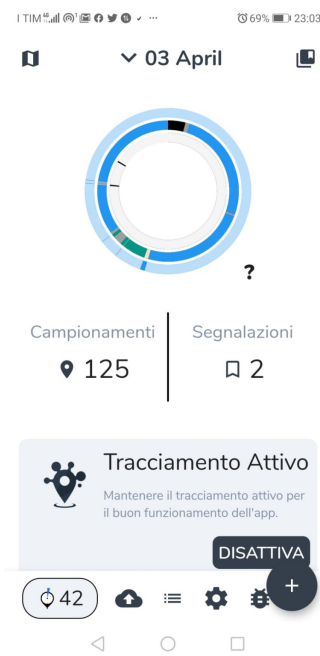
Figure 1: Main screen of the application.

of movement detection with the built-in accelerometers, activity recognition, data from GPS sensors, and Bluetooth Low Energy (BLE) transmission is used to adaptively track the user’s movements and interactions without negatively impacting battery and storage capacity of the device. Traces are collected autonomously by a background service launched by the application, but end-users can decide at any time to interact with the app to browse stored data, to force sampling, to mark known locations or the add notes.