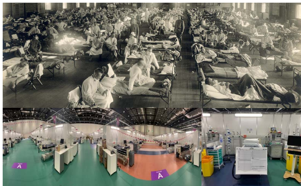
Figure 3: Field hospitals in pandemics: 1918 vs 2020