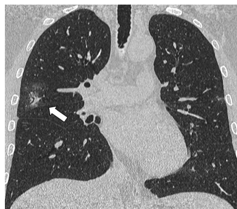
Figure 1. The HRCT scan of a 46-year-old male patient with a severity score of 6 showed consolidation at the right upper lobe, with the evidence of fibrosis, as manifested by the tract bronchiectasis.

A tendency of unifocal and less lobes involved with GGO, as well as less severity scores was found in patients with a relatively shorter duration between the illness onset and CT. Furthermore, GGO tended to have a basilar or subpleural distribution at the lower lobes in early stage but a peripheral distribution at the left and right upper