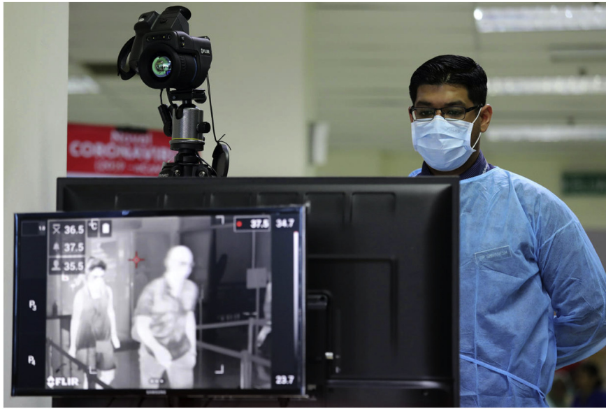
Fig. 2. Airport screening for infectious disease.

maintain surveillance and to establish triggers for further intervention would seem to be wise.